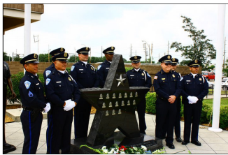
Beaumont Police Memorial