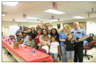
Houston PD Airport Police